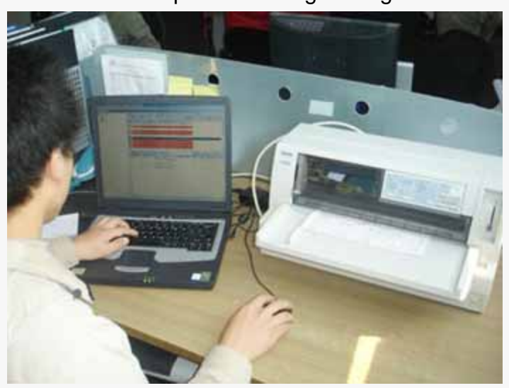
PDSOFT-Pipe Processing Management