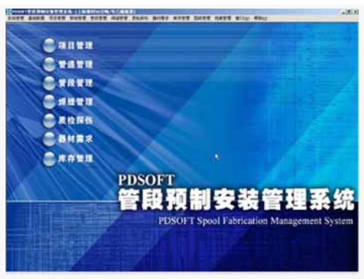
PDSOFT-Pipe Processing Management