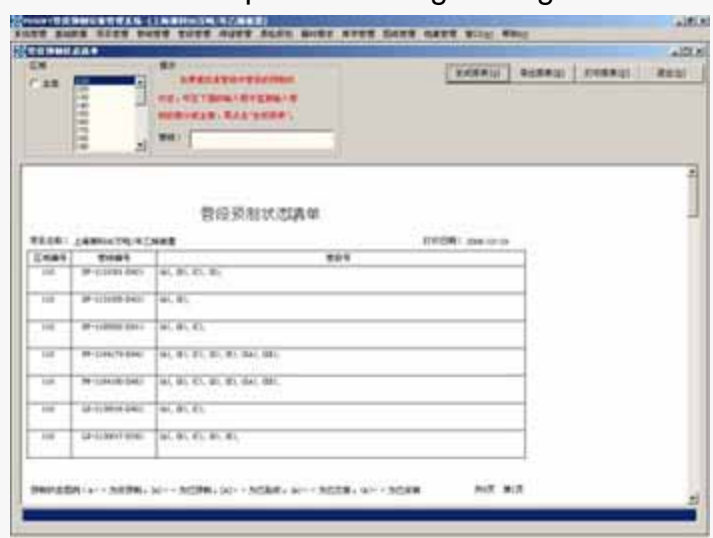
PDSOFT-Pipe Processing Management